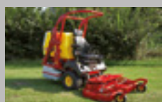
TURBOGRASS 22-23 hp