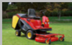
GTR 16-20 hp