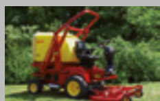
PG - SR 22-28 hp