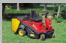
GTM - GSM 15,5-16 hp