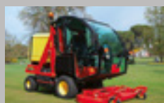
TURBO 1-1W-2-4 28-44 hp