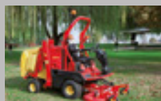
GT 28 hp