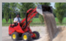
TURBOLOADER 22-36 hp