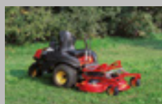
TURBO Z 23 hp