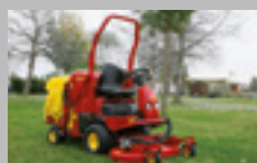
GTS 22-23 hp